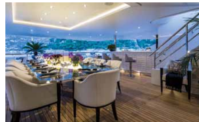
OPPOSITE: A bird's-eye view reveals the owner's private Jacuzzi as well as a sundeck swimming pool. ABOVE AND RIGHT: The owner's upper-deck domain.